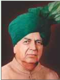
Jan Nayak Chaudhary Devi Lal

The Sirsa School was envisioned to enhance and promote the prosperity and progress of Haryana, with its roots in a sound education system. The dream was given concrete shape on the outskirts of Sirsa, Haryana to nurture the vision of the great leader of the masses, Jan Nayak Chaudhary Devi Lal. Introduced in 2004, The Sirsa School is a step towards realising his aspiration for a better education encompassing varied aspects of growth and development, not just academics. The school is run & managed by Chaudhary Devi Lal Memorial Trust.